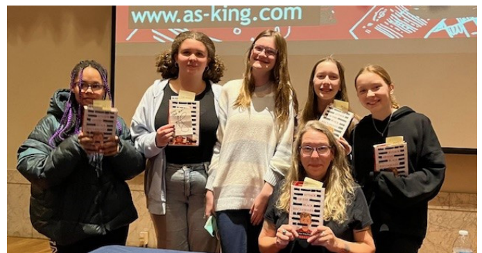
Obama's middle school book club participated in a book talk with author A.S. King.

Although Obama Academy has yet to return to its pre pandemic high of IB engagement, when the majority of seniors sat for exams, it is clear that testing levels are on the rise.