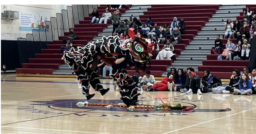
the lion dance being performed