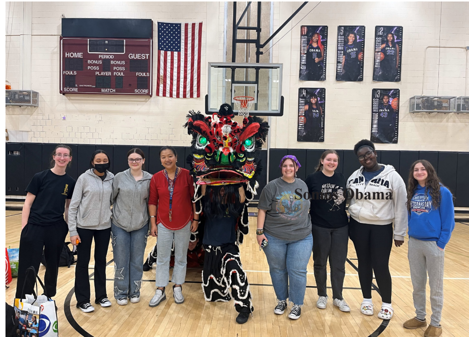
The lion dance in the Gym

The thirty minute performance included interactive moments where the lion