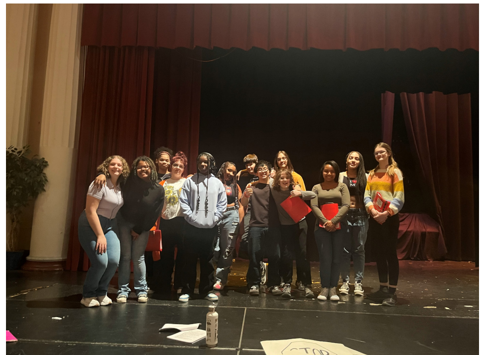
Picture from a drama club meeting

As schools continue to announce if they will remain test optional for another application period, it is important for students to responsibly delegate time to studying for the SAT.